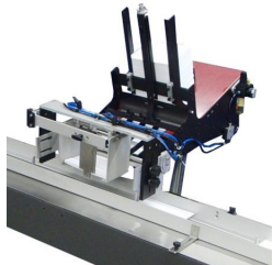
Victory SD Dropper