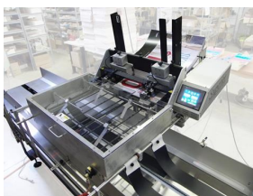
Victory RD Dropper