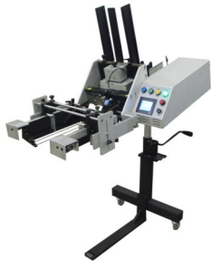
Victory BD Dropper

XM-12 Ultra Max Count: 9,999+ pcs. Max Speed: 750 ft/min Product Sizes: Min. 2"W x 3"L Max. 12"W x 12"L